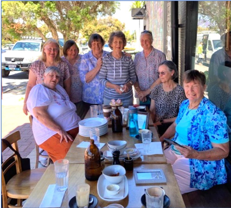
These celebration photos are linked with the Perth report which is on the previous page.